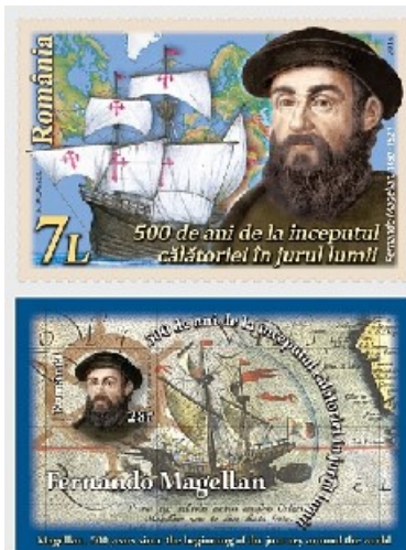
Romania Issued Stamp and MS

on Fernando Magellan On the stamp with the face value of Lei 7, you will discover the image of the greatest navigator from the Age of Discovery, Fernando Magellan. The imperforated souvenir sheet with the face value of Lei 28.50, illustrates a fragment from Ortelius’s map, dated 1589, depicting the West coast of South America and the ship Victoria. Above the ship, there is a stylized globe surrounded by the inscription “500 years since the beginning of the journey around the world”, representing his trans-global expedition.